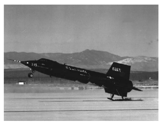
X-15 landing at Edwards AFB.

A typical flight profile for an X-15 flight began with the plane being released from a B-52 over Windover AFB in Nevada. After release, the pilot