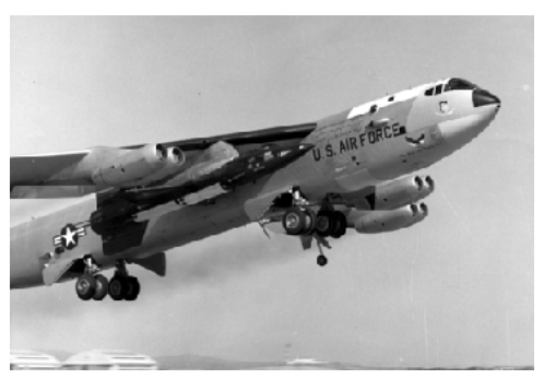
X-15 captive on a B-52

Ron Panton describes features of the X-15