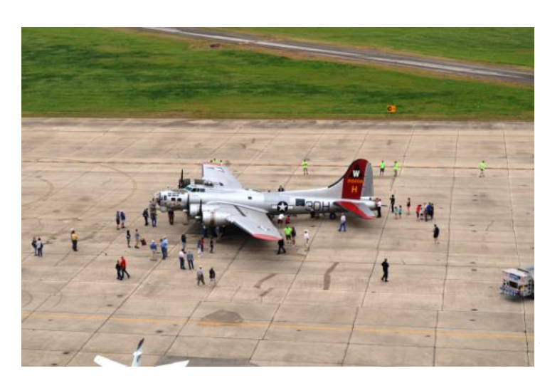
Attendees constantly gathered around the Fortress. Some took ground tours, others bought rides.

that readers might be interested in joining the Chapter.