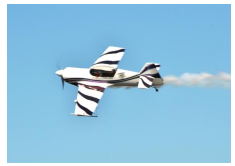
A khife edge maneuver and then an extended downwind course for landing.