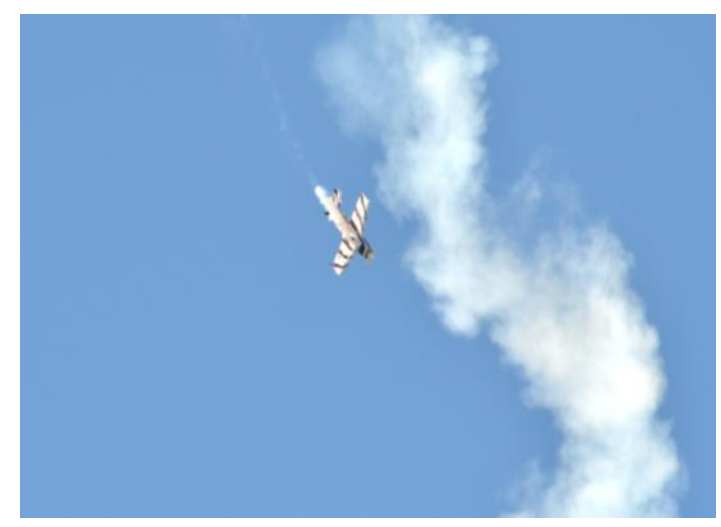
After the climbing rolls a dive ensues....