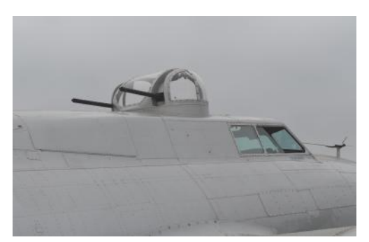
Top turret guns