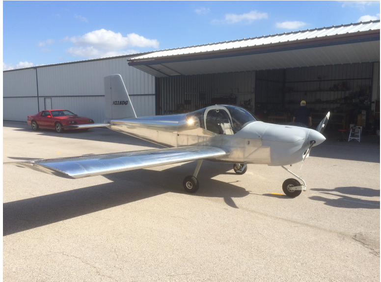
N218DG on the day of the first flight.

A huge congratulations goes out to chapter members Dick and Tish Gossen for the first flight of their RV-12. The flight took place at the Georgetown Municipal Airport. We hope to get all the details of the flight at the March meeting.