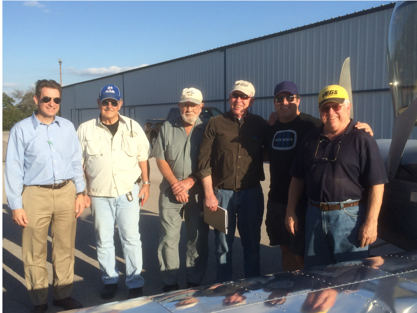
A crowd of supporters gathered to help celebrate the flight!